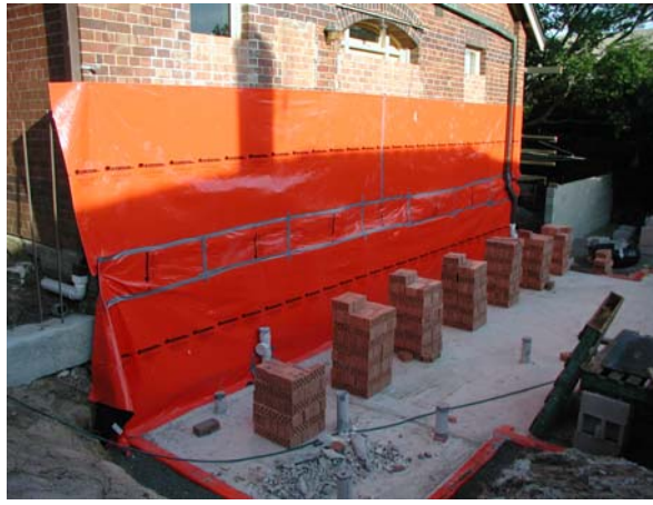
photo 1 showing existing structure with Kordon TB secured as per sketch